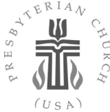
PC(USA) June 10, 1983

This congregation welcomes you without regard to race, ethnicity, age, sexual orientation, gender identity, physical or mental ability, education, economic circumstance, your place of origin or any other issue that divides God's family. We are Christ's people, and this is Christ's place with its doors wide open. If you are passing through, Godspeed. If you are looking for a worship home, stay with us. We invite visitors to join us, but most of all, to return often.