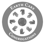
an Earth Care Congregation