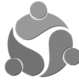
a Matthew 25 Church