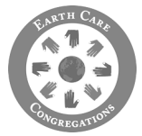
an Earth Care Congregation