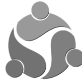
a Matthew 25 Church