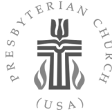
PC(USA) June 10, 1983

This congregation welcomes you without regard to race, ethnicity, age, sexual orientation, gender identity, physical or mental ability, education, economic circumstance, your place of origin or any other issue that divides God's family. We are Christ's people, and this is Christ's place with its doors wide open. If you are passing through, Godspeed. If you are looking for a worship home, stay with us. We invite visitors to join us, but most of all, to return often.